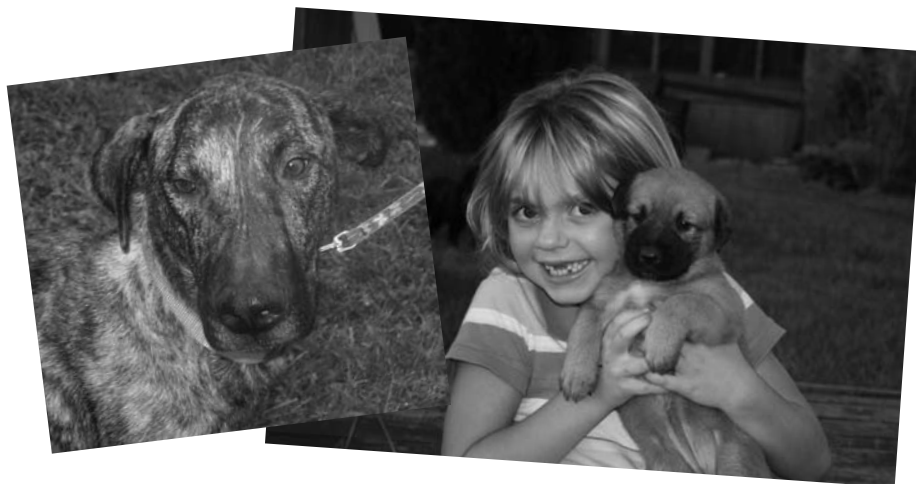
Left: Pups’ mother, Honey, 10 days after being rescued. Right: Gwendolyn with Dreamer, three weeks after rescue.